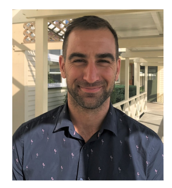
Justin Tate Photography/Design/Art