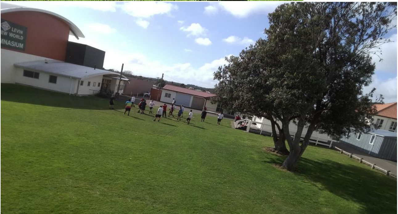
Below: Up high filming students playing rugby.