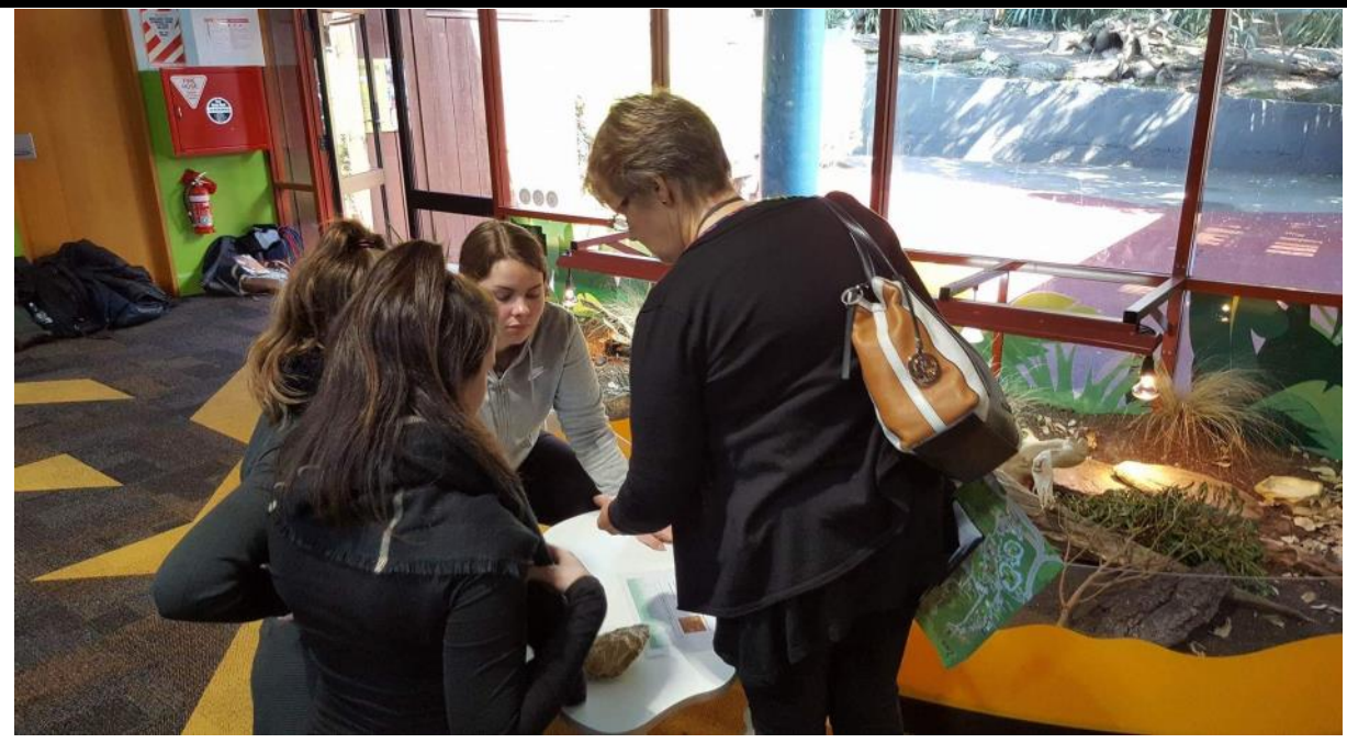
The Year 13 Biology students enjoyed the annual trip to Wellington Zoo. They had talks from the zoo staff on human evolution and animal behaviour followed by a guided tour to see some of the animals.

The students were given enrichment activities by our zoo educator and they now have plenty of examples to use in their upcoming assessments.