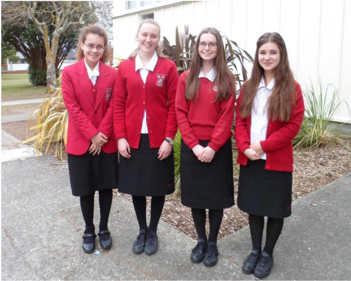
Year 11-13 Uniform